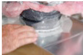
Install tie-strap and apply fiberglass mesh tape