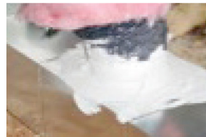
Apply mastic directly on the duct