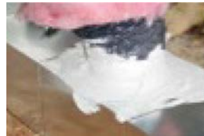
Apply mastic directly on the duct