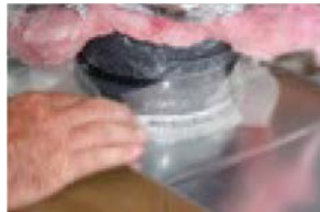
Install tie-strap and apply fiberglass mesh tape