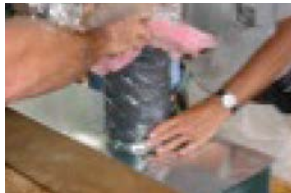
Pull back outside sleeve and duct insulation to expose flexible duct